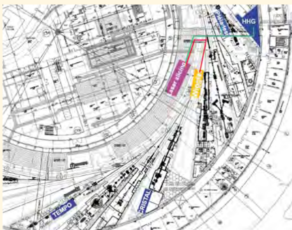
Figure 2: Diagram showing the location of the Femto-Slicing laser hutch, of the wiggler modulator, of the TEMPO and CRISTAL beamlines and of the HHG and PLEIADES experimental hutches.

constraints. The wiggler must emit radiation at the same wavelength as the laser (800 nm), the total radiated power must be below the limit set by the front-end of the beamline and the performance of the ring, in terms of emittance and beam lifetime, must be preserved. In addition, the wiggler must yield a high photon flux up to 50 keV to satisfy the PUMA beamline specifications. The magnetic studies, in one hand, and beam dynamics, on the other, have converged on to a wiggler with 20 magnetic periods of 164 mm, a length of 3.28 m and a maximum magnetic field of 1.63 T. The power emitted is 20 kW.